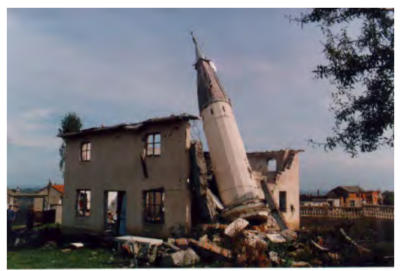
Retia/Retimlje. Village mosque blown up by Serbian forces, March 1999.

The years of peacetime neglect were followed by the massive wartime destruction of Kosovo's Islamic religious heritage in 1998-1999. As has been documented in this book, roughly 40 percent of Kosovo's 560 mosques were damaged or destroyed during the war.