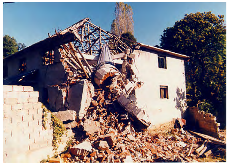
Mushtisht/Mušutište. Mosque of Hasan Pasha (1702). Blown up in April 1999.

An additional 95 mosques suffered lesser degrees of damage, ranging from shell holes in the walls, through the roof or in the shaft of the minaret, to vandalism, including fires set inside the mosque, smashed-up interior furnishings, and the desecration of sacred scriptures.