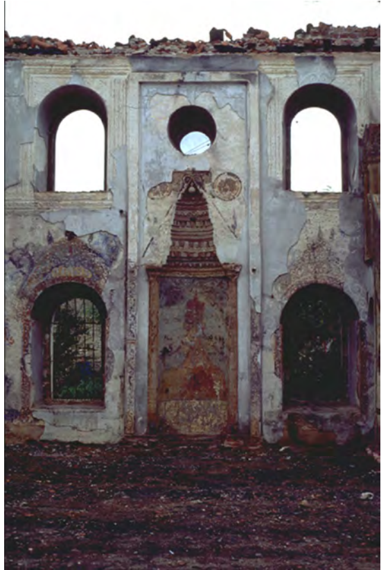
Peja/Peć. Red Mosque (1755), burned by Serbian troops and police March 1999

Among the worst hit was the northwestern region of Peja/Peć, where every one of 49 Islamic sites was attacked in 1998 and 1999. Among the sites targeted were the region's 36 mosques (half of them dating from the 15th-18th centuries), the offices, archives and library of the Islamic Community Council of Peja, a historic medresa, a 15th-century hamam (Turkish baths), 9 schools for Qur'an readers (mekteb), a dervish lodge (tekke), and several mosque libraries.