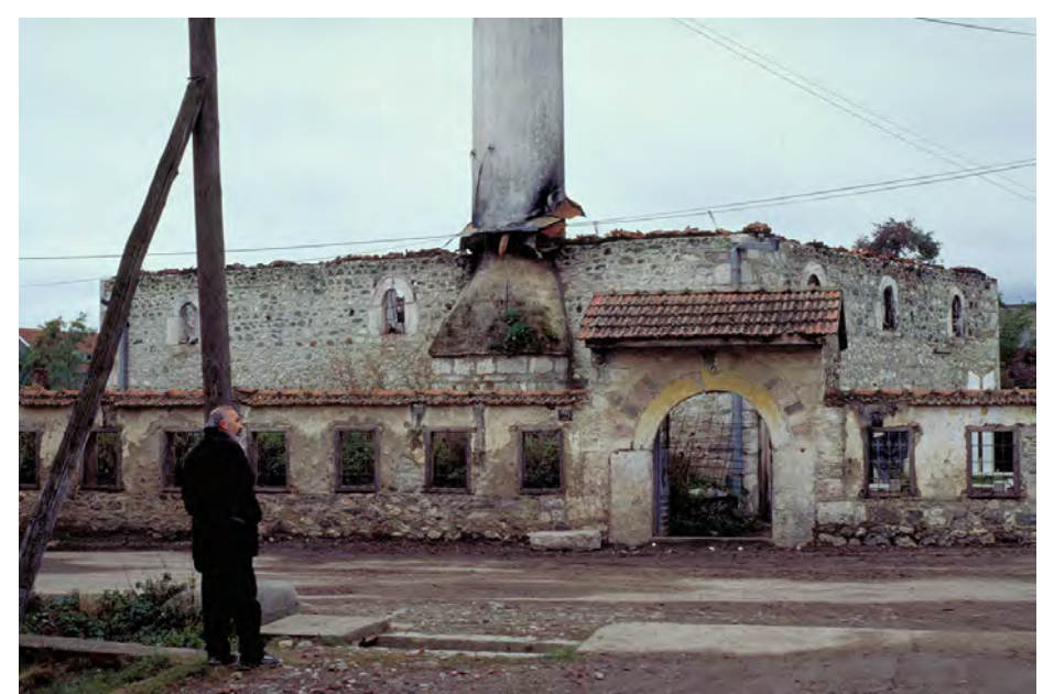
Deçan. Mosque, built like a kulla; the mosque was burned in the 1999 war.

Islamic religious architecture of the eighteenth and nineteenth century in Kosovo was distinguished by the exuberant use of colour and by the murals depicting landscapes, architecture and floral motifs that covered the interior walls of mosques. This painted decoration was a characteristic feature of mosques built during this period, among them the Red Mosque in Peja/Peć (1744) and the splendid Jashar Pasha Mosque in Prishtina (1834). Lavish mural paintings were also used to decorate older mosques that were renovated at this time, such as the Hadum Mosque in Gjakova/Đakovica (built 1592-95, renovated in 1842), the Sinan Pasha Mosque in Prizren (built 1615, renovated in the early 19th century), and the Bazaar Mosque in Peja (built 1471, renovated by Haxhi Zeka in the late 19th century).