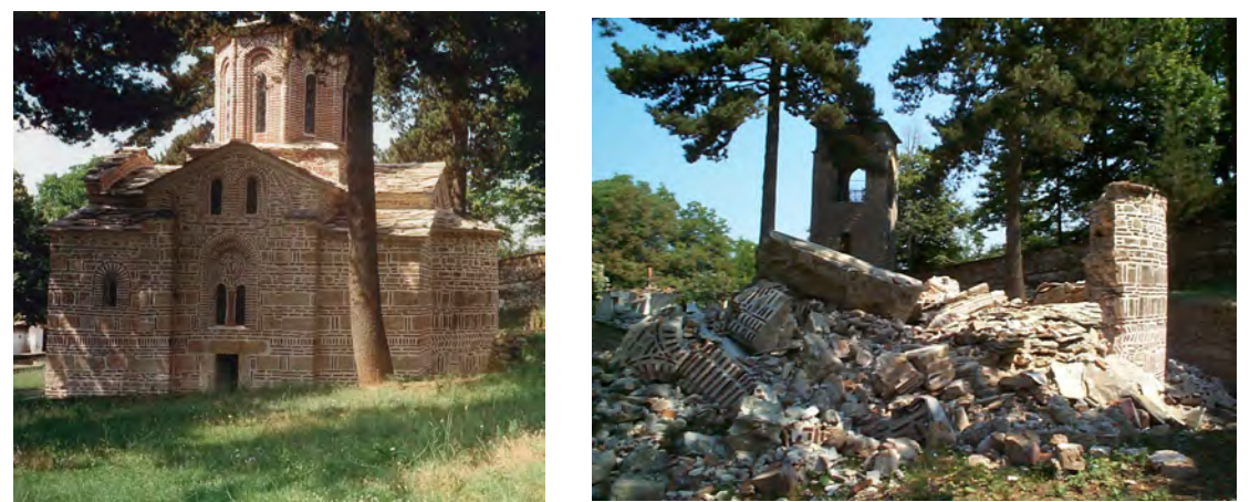
Mushtisht/Mušutište. Church of the Holy Virgin Odigitria (1315), before and after it was destroyed by returning Kosovo Albanians in July 1999.

Unfortunately that changed after the end of the war, as thousands of Albanian refugees who had been forced out of Kosovo during the war returned to their burned-out home towns and villages. Following the end of hostilities in June 1999, dozens of Serb Orthodox churches and monasteries were damaged in revenge attacks. Some 40 Serb Orthodox sites were vandalized, while another 40 suffered serious structural damage or were destroyed completely. Many of these buildings were village churches, some of them built during the previous decade. But about 15 to 20 of the destroyed churches dated from the medieval period.