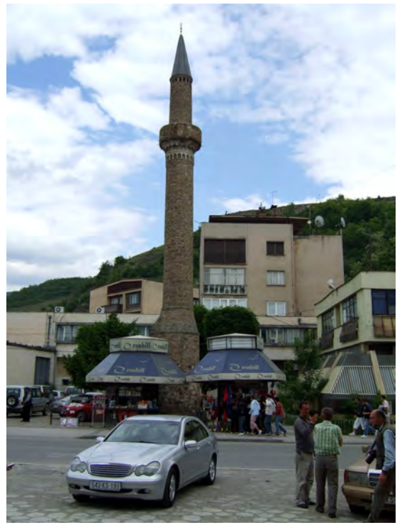
Prizren. The minaret of the torn-down Arasta Mosque.

but no new mosques were built in Prishtina between 1912 and the end of the twentieth century.