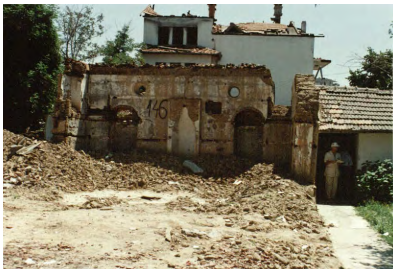
Mitrovica. Tekke (dervish lodge) of Sheh Fejzullah. Destroyed in spring 1999.

A total of 31 mosques and 2 tekkes (dervish lodges) were attacked by Serb forces during the first year of the war, in the spring and summer of 1998. Two-thirds of these religious buildings were burned down, blown up or otherwise destroyed or seriously damaged. Ten of the mosques that were damaged during 1998 were subjected to repeat attacks and further damage during the spring of 1999. During the second year of the war in 1999, a total of 197 mosques and 9 tekkes in Kosovo were damaged or destroyed by Serb forces. One mosque, in the village of Jabllanica (Prizren region), had its roof partly destroyed by a NATO air strike in the spring of 1999. Otherwise, the destruction of mosques and of other Islamic heritage in Kosovo during the war was entirely attributable to attacks from the ground, carried out by Serbian troops, police and paramilitaries, and in some cases by Serb civilians.