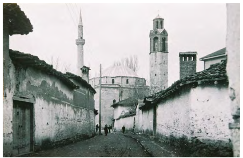
Prishtina. Mosque of Sultan Mehmed the Conqueror (1461).

Notable Islamic monuments from the early Ottoman period in Kosovo include the Mosque of Sultan Murad (built 1389-1440), in Prishtina, the Mosque and hamam of Sultan Mehmed the Conqueror (1461), in Prishtina, and the Market Mosque (1471), in Peja/Peć—all of them endowed by Ottoman emperors. The Ghazi Ali Beg Mosque (1410) in Vushtrria/Vučitrn, and the mosque and hamam of Hajji Hasan Beg (1462-85), in Peja/Peć, were founded by early Ottoman governors. The Llap Mosque (1470), in Prishtina, was endowed by a pious local Muslim resident.