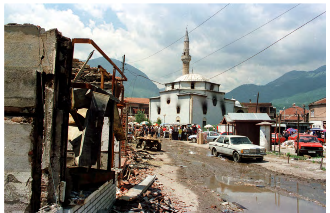
Peja/Peć. The Market Mosque (1471), torched by Serbian policemen, June 1999.

Among the worst hit was the northwestern region of Peja/Peć, where every one of 49 Islamic sites was attacked in 1998 and 1999. Among the sites targeted were the region's 36 mosques (half of them dating from the 15th-18th centuries), the offices, archives and library of the Islamic Community Council of Peja, a historic medresa, a 15th-century hamam (Turkish baths), 9 schools for Qur'an readers (mekteb), a dervish lodge (tekke), and several mosque libraries.