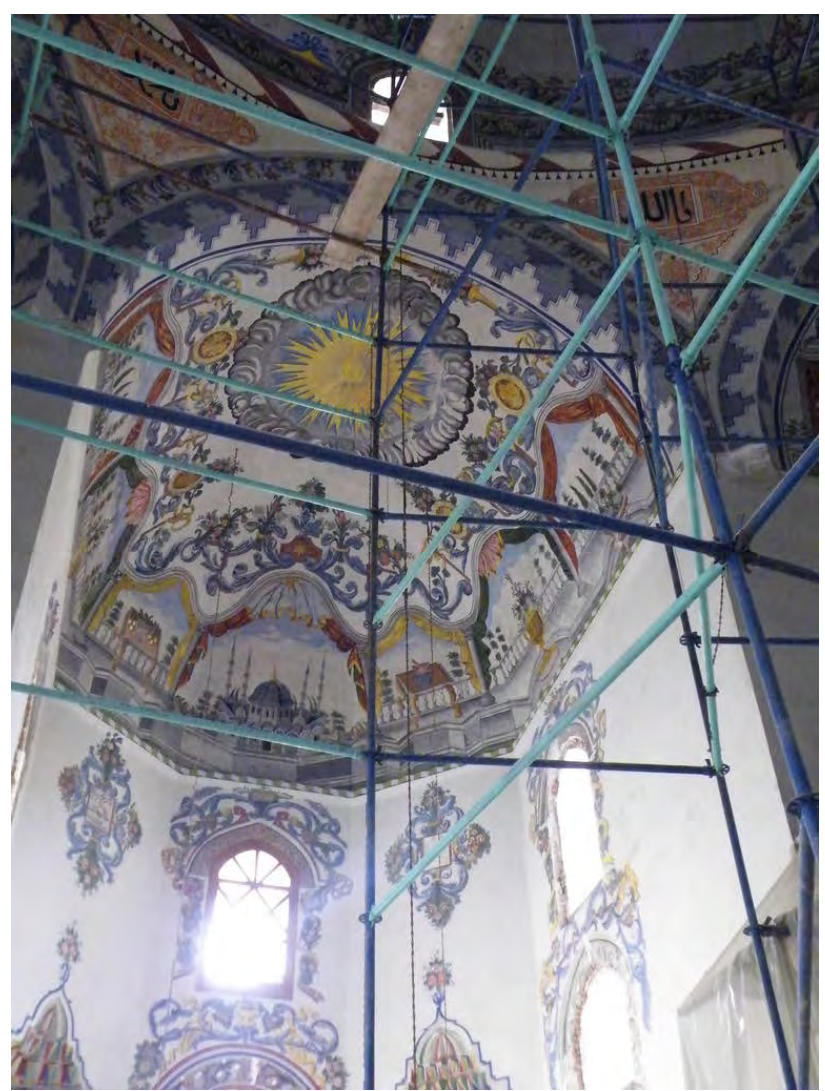
Prizren: Mural paintings in the Sinan Pasha Mosque.

The first Balkan War (1912) brought an end to the long centuries of Ottoman rule in Kosovo, which was partitioned between Kingdom of Serbia and the Kingdom of Montenegro. Following the end of the First World War, the two kingdoms merged to form a new state, which in 1929 was renamed Yugoslavia. During the 70 years that followed, not very many mosques were built in Kosovo and some were destroyed or seized by the authorities.