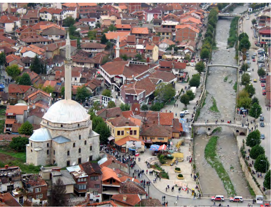
Prizren: Bird's-eye view of the Sinan Pasha Mosque (1615).

Islamic religious architecture of the eighteenth and nineteenth century in Kosovo was distinguished by the exuberant use of colour and by the murals depicting landscapes, architecture and floral motifs that covered the interior walls of mosques. This painted decoration was a characteristic feature of mosques built during this period, among them the Red Mosque in Peja/Peć (1744) and the splendid Jashar Pasha Mosque in Prishtina (1834). Lavish mural paintings were also used to decorate older mosques that were renovated at this time, such as the Hadum Mosque in Gjakova/Đakovica (built 1592-95, renovated in 1842), the Sinan Pasha Mosque in Prizren (built 1615, renovated in the early 19th century), and the Bazaar Mosque in Peja (built 1471, renovated by Haxhi Zeka in the late 19th century).