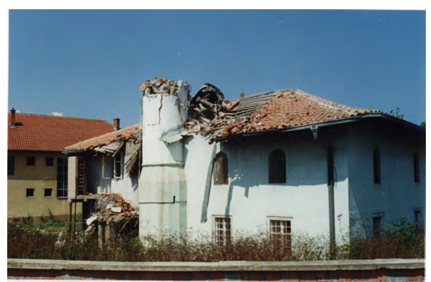
Vushtrria. Gazi Ali Beg Mosque (1410), its minaret blown away by a tank cannon

Of the 218 mosques and 11 tekkes in Kosovo that were destroyed or damaged during the war, 22 mosques and 8 tekkes were in the most severe damage categories. Among these, 13 mosques and 5 tekkes were completely razed, the ruins levelled by bulldozer; 9 mosques and 3 tekkes were reduced to rubble, but the ruins were not bulldozed. Among examples of completely levelled Islamic houses of worship are the Bazaar Mosque (built 1761-62; renewed 1878) in Vushtrria/Vučitrn, the Ibër Mosque (built 1878) in Mitrovica, the Mosque of Halil Efendi in Dobërçan/Dobrčane (1526), the Mosque of Loxha (1900), and the historic Bektashi tekke in Gjakova/Đakovica (1790).