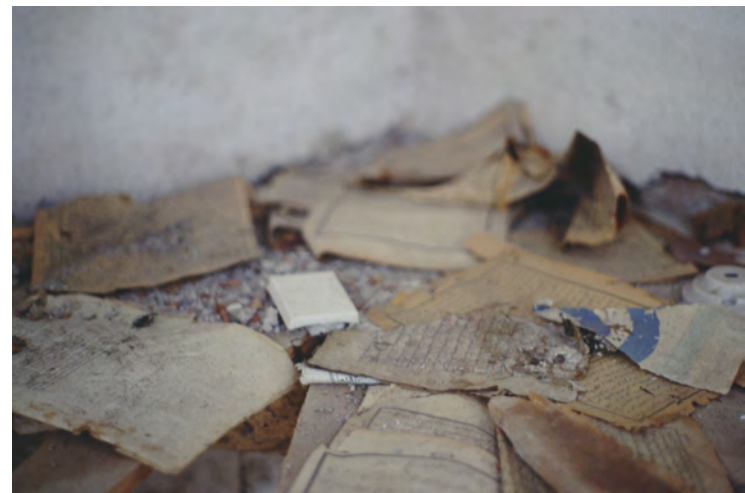
Carraleva/Crnoljevo. Torn-up and desecrated Qur'ans in the village mosque.

In some places, those responsible for these attacks had left behind their "signatures"— in the form of anti-Albanian and anti-Islamic graffiti in Serbian scrawled on mosque walls, or in the deliberate desecration of Islamic sacred scriptures, torn apart by hand, defiled and burned. Examples of this sort could be seen in the Gjylfatyn Mosque in Peja, the Mosque of Carraleva/Crnoljevo, the Mosque of Livoç i Poshtëm/Donji Livoč, and the Mosque of Stanofc i Poshtëm, and in a number of other mosques.