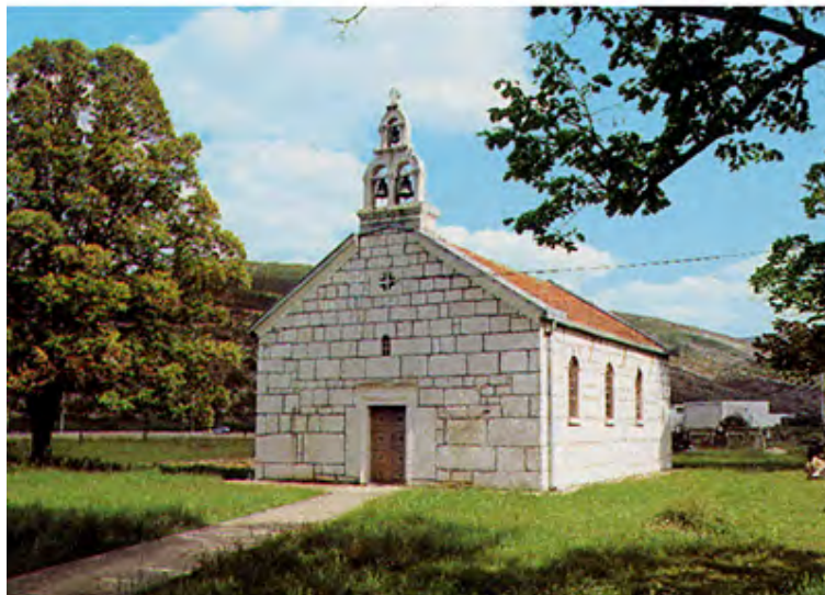
[6.] The Roman Catholic ( top ) and Serbian Orthodox ( bottom ) churches in the village of Ljubinje in eastern Herzegovina.

The remarkable thing about all of the above examples is that they involve items made for religious purposes, for which the symbolic content matters more than it would in objects intended for mundane uses. Yet, those who commissioned these objects, those who made