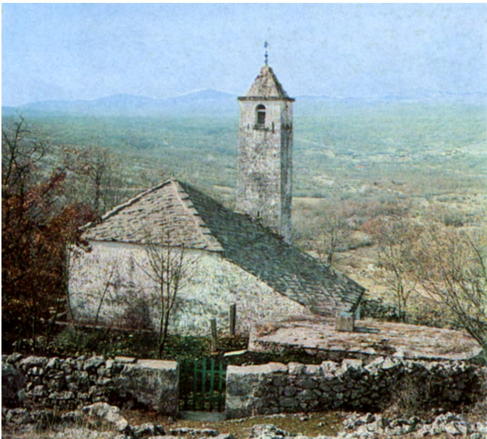
[4.] The Avdić Mosque (17th century) in Plana, near Bileća in Herzegovina.

Thus, a number of mosques in the Herzegovina region, among them a lovely small mosque built in the 17 th century by a local Bosnian Muslim family of notables in the village of Plana, near Bileća, have the look of medieval churches, with minarets that resemble rustic Romanesque church steeples.