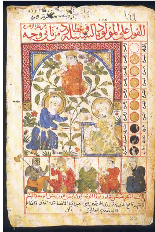
[11a.] Partially burned Ottoman document from the Oriental Institute’s destroyed archive. [11b.] Pre-war photograph of a page from one of the Oriental Institute’s 5,263 Islamic manuscript codices, a 15th-century astrological treatise, burned in May 1992.