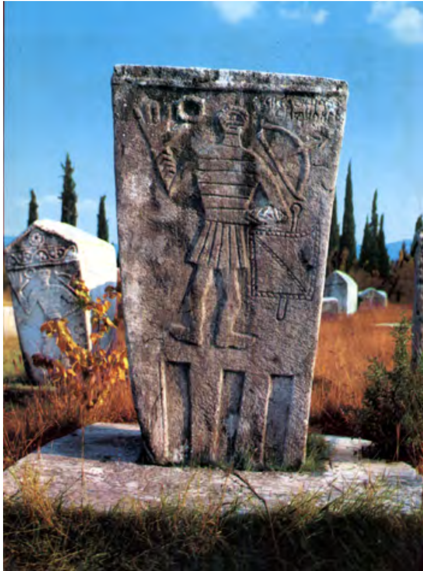
[1.] Medieval Bosnian gravestones ( stećci) at Radimlja, near Stolac in Herzegovina.

Islam arrived in Bosnia more than 500 years ago, when the armies of the Ottoman sultans swept across the Balkans and onwards into Hungary. Their advance appeared unstoppable, and many at the time felt that it was directed by the hand of God. Throughout Europe, this was an age of religious ferment and preachers everywhere, among them Martin Luther, saw in the coming of the Ottomans a sign of divine judgment. In Bosnia, many people from all social and religious backgrounds---more than half the population by the 1700s---adopted the triumphant faith of the Islamic conquerors. A distinctive Bosnian Muslim culture took form, with its own architecture, literature, social customs and folklore.[5]