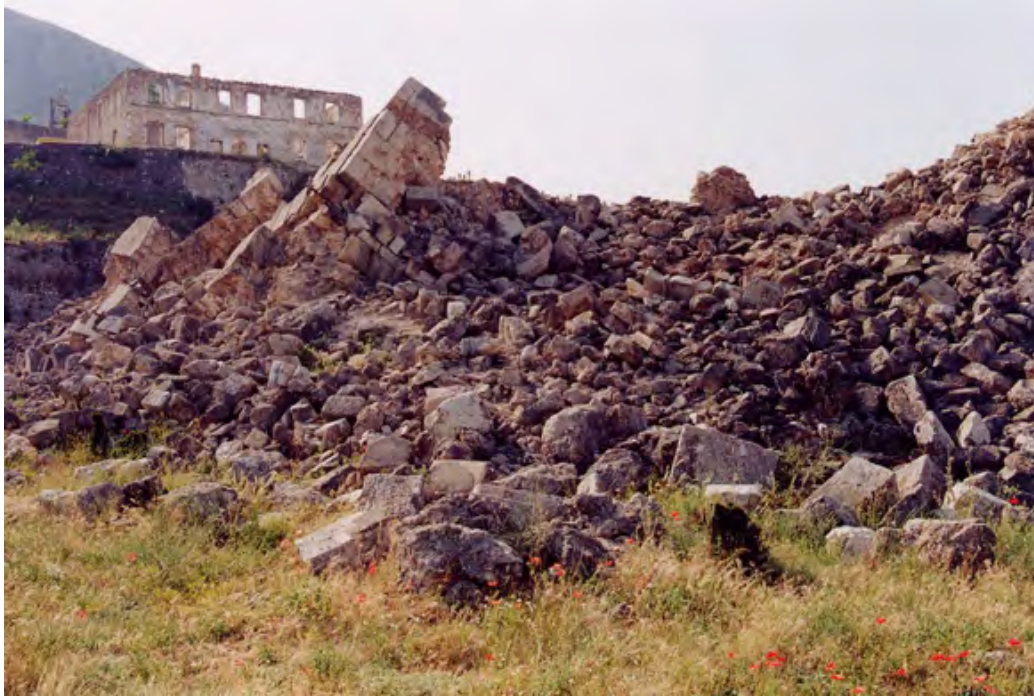
[15.] The blasted ruins of the Serbian Orthodox Cathedral (Saborna crkva) in Mostar, blown up in June 1992 by Croat nationalist extremists.

During the same month, Croat militias rounded up and expelled or imprisoned Bosnian Serb civilians living in areas under their control. At the end of the summer, Croat nationalist forces began the process of expelling all non-Croats from their self-styled “Croatian Republic of Herceg-Bosna”. First to be “cleansed” was the small town of Prozor, where in October 1992, Croat nationalists shelled the mosque and the surrounding neighborhood, robbed and terrorized the town's 5,000 Muslim inhabitants and sent them fleeing into the mountains as night fell. [23]