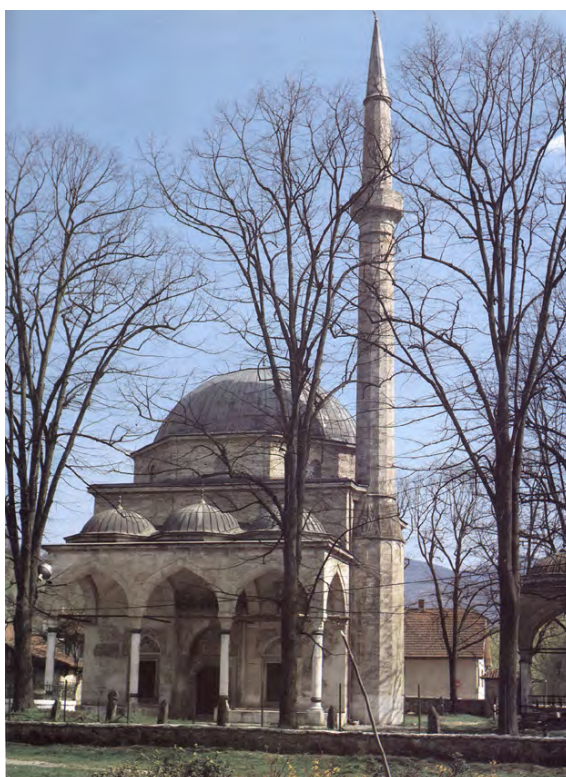
[12.] The 16th-century Aladža Mosque in the eastern Bosnian town of Foča on the Drina, before the war.