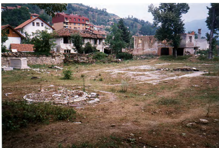
[13.] Cleared site of the Aladža Mosque in Foča after the war. The circle of stones seen in the foreground is what remains of the marble ablution fountain (sadrvan); the outlines of the razed mosque's foundations can still be seen in the grass growing on the site. (Photo: 1996 Lucas Kello. Documentation Center, Aga Khan Program, Fine Arts Library, Harvard University).