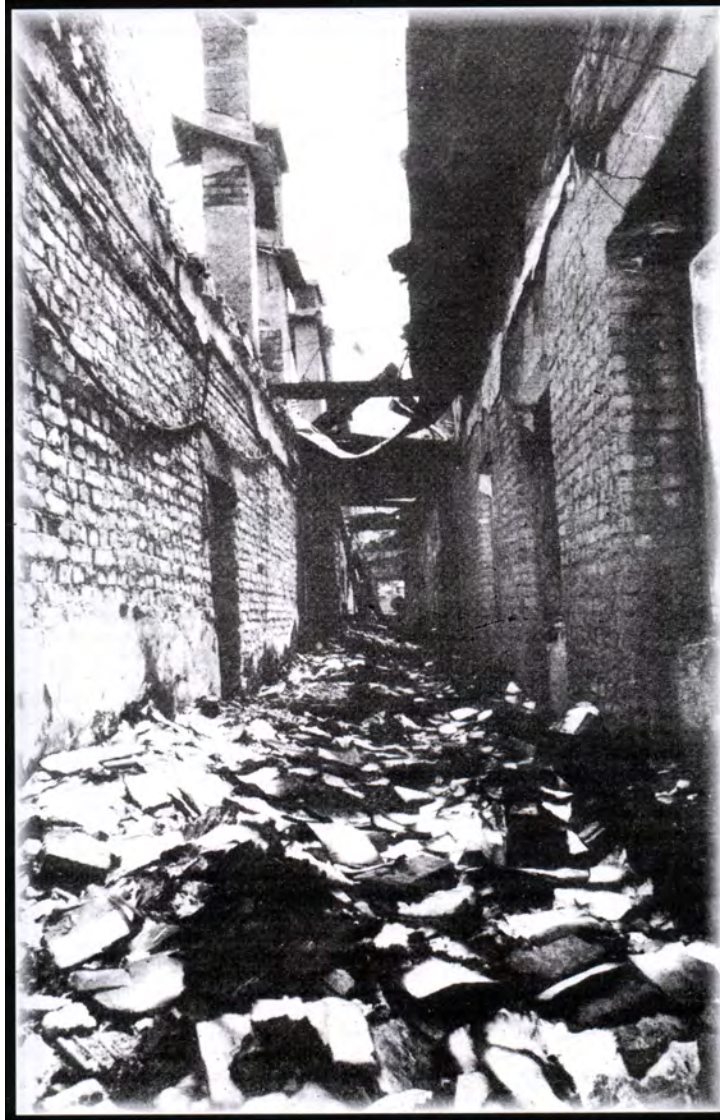
[10.] Interior of the Oriental Institute in Sarajevo, carpeted with the ashes of burned books and manuscripts, after it was shelled and burned by Serb forces in May 1992.