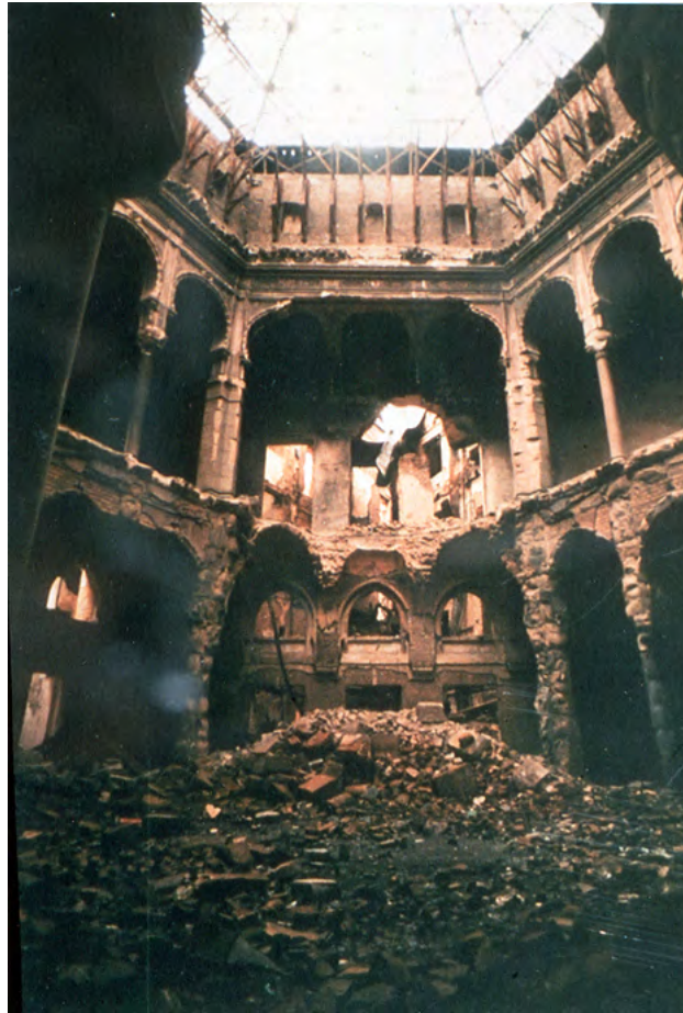
[9a.] The National and University Library of Bosnia-Herzegovina on fire, August 26, 1992, following bombardment by Bosnian Serb forces. [9b.] View of the burned-out interior of the National and University Library, Sarajevo. (Photos: Documentation Center, Aga Khan Program, Fine Arts Library, Harvard University).

A librarian who was there described the scene: