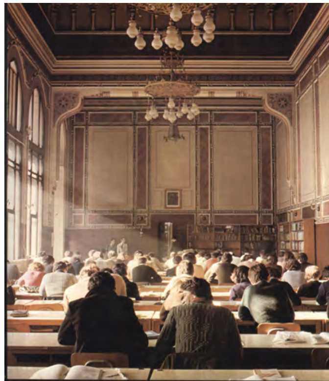
[8.] The same room in the Vijećnica (old Town Hall), being used as the main reading room of the National and University Library of Bosnia-Herzegovina in the 1980s.