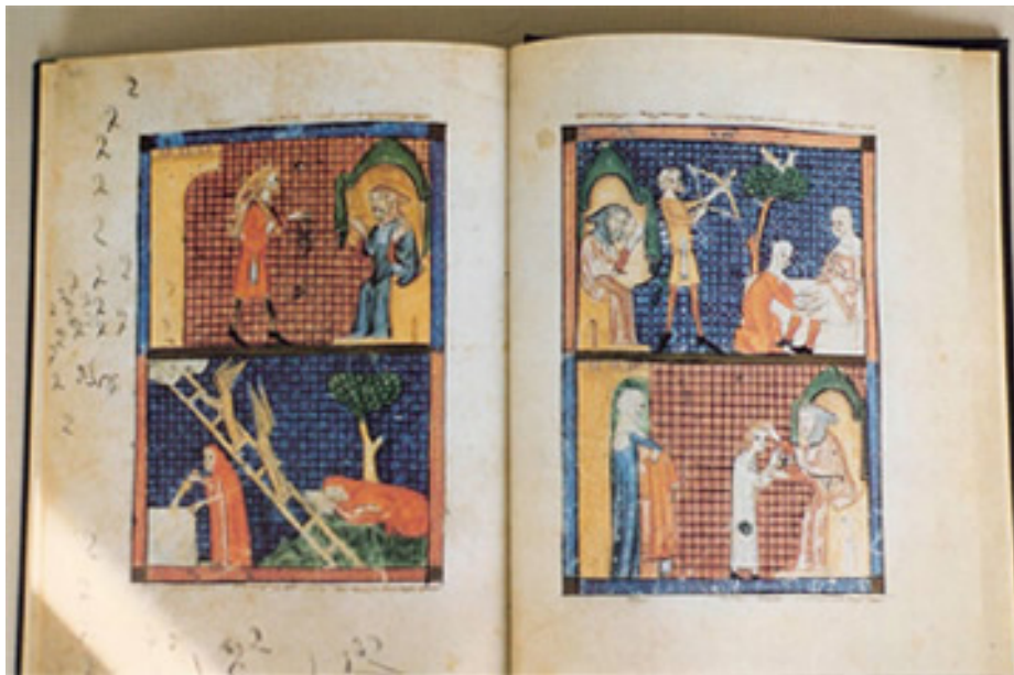
The Sarajevo Haggada

The Sarajevo Haggada contains poems, prayers and paintings about Passover and the escape of the Jews from Egypt. It was made between the 12th and 14th centuries, and was brought to Bosnia by the Cohen family in the 16th century, after Isabella expelled the Jews from Spain. It is perhaps the most beautiful and important haggada in existence. Scholars from all the world come to see it. But when people come now, I show them a copy. The original is safe and sound.