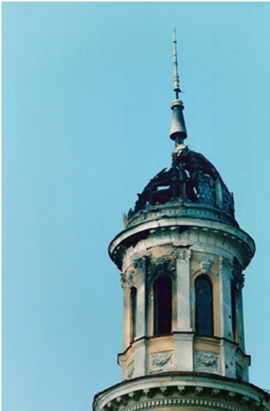
The Olympic Museum

The Olympics were really something fantastic here. Now, a beautiful old building from the Austrian era and all the documentation of the Sarajevo games have been destroyed.