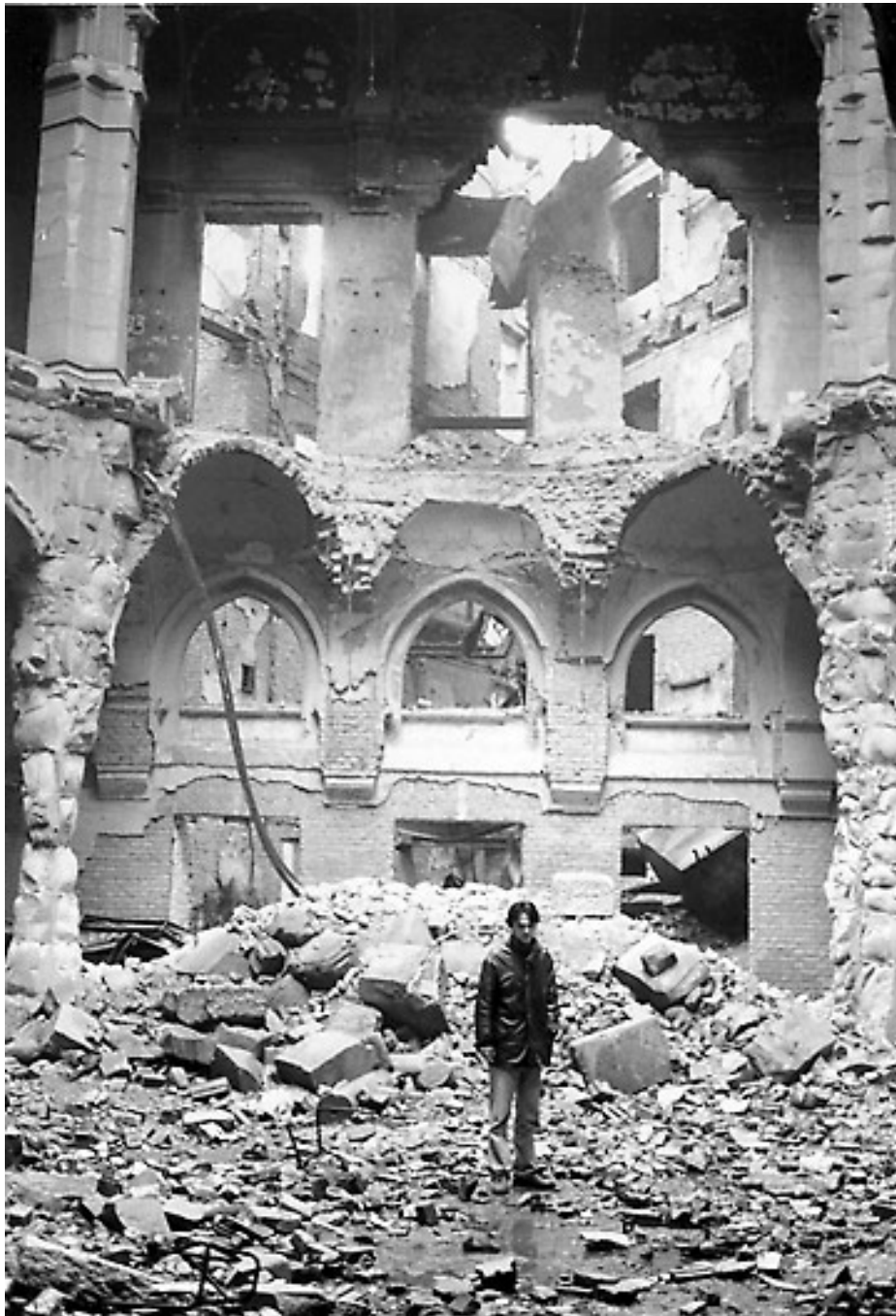
The National Library

Yes. But only if one can truly believe, as Bulgakov insisted, that “manuscripts do not burn.”